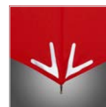
3M™ Scotchlite™ Reflective Material