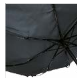
Windproof system with FARE®-FlexBar plastic ribs