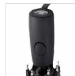
Soft-Touch handle with push-button and promotional labelling option